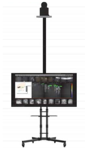
1 KM Detection Camera