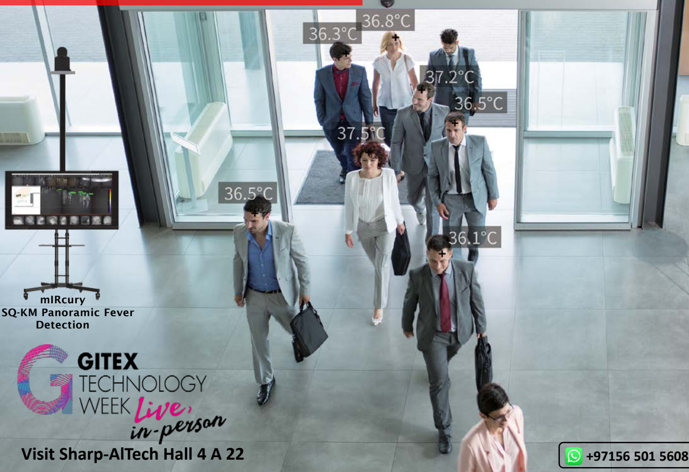
mIRcury 1 SQ-KM Panoramic Fever Detection